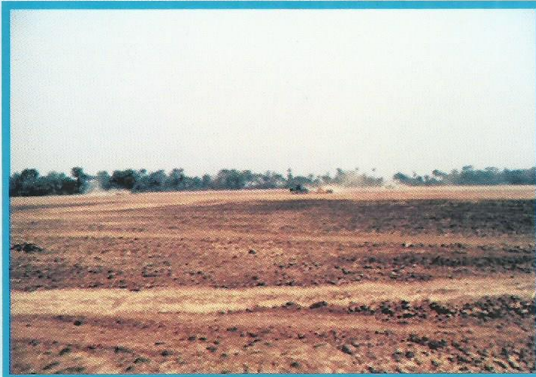
SGSE - LAND PREPARATION FOR FURROW IRRIGATION