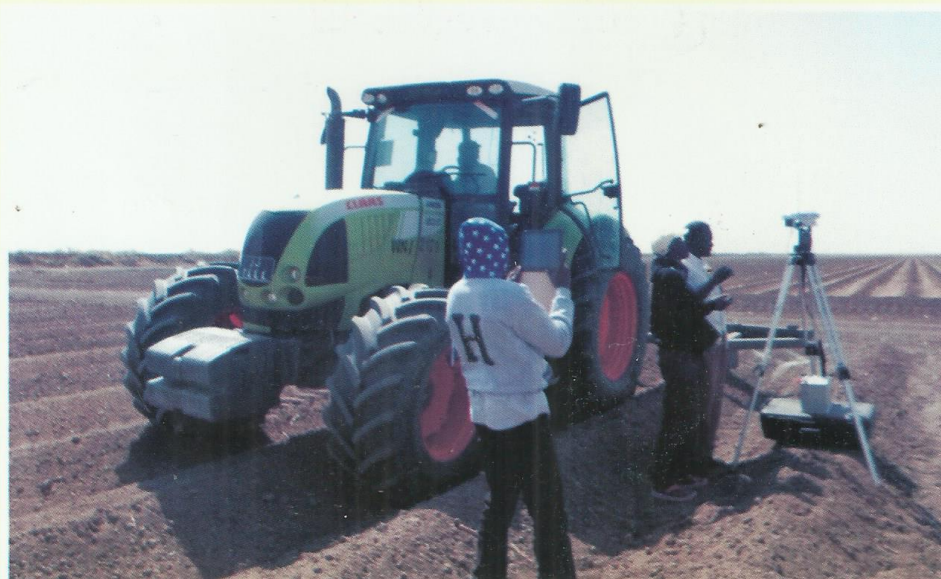
NSDC team receiving orientation on principles and operations of automatic furrow maker (laser steel) at Phase II of White Nile Sugar Company