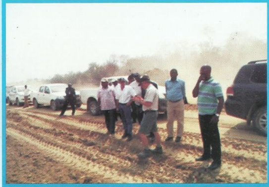
SIMOG AT SGSE'S DYKE CONSTRUCTION SITE