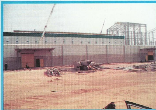
SUNTI GOLDEN SUGAR ESTATE - MILL UNDER CONSTRUCTION