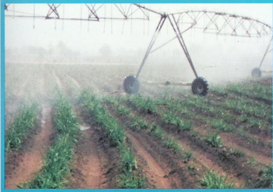
SGSE'S CENTRE PIVOT IRRIGATION SYSTEM IN OPERATION