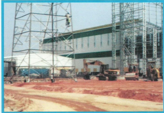
SUNTI GOLDEN SUGAR ESTATE - MILL UNDER CONSTRUCTION - ANOTHER VIEW