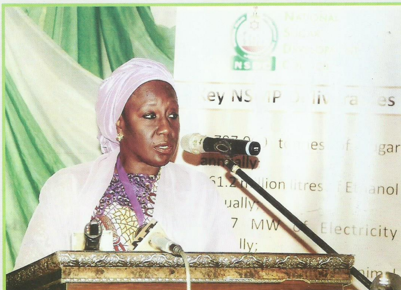
Hajiya Aisha Abubakar Minister of State Federal Ministry of Industry, Trade & Investment

He also told the gathering that the NSDC has entered into a number of collaborations and provided support to sugar projects as well as sugarcane outgrower farmers in most states in the Northern region of the country.