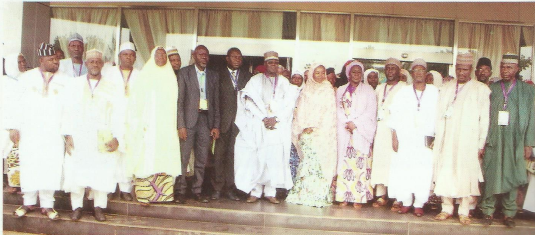
Guests and top management staff of the NSDC in a group photograph at the event in Sokoto State

"Participants noted that the implementation of Zero percent (0%)