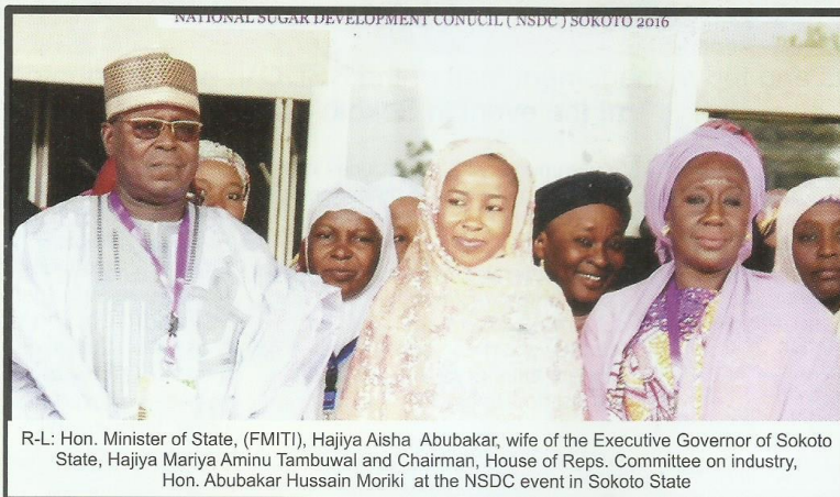
NATIONAL SUGAR DEVELOPMENT COUNCIL (NSDC) SOKOTO 2016 R-L: Hon. Minister of State, (FMITI), Hajjiya Aisha Abubakar, wife of the Executive Governor of Sokoto State, Hajjiya Mariya Aminu Tambuwal and Chairman, House of Reps. Committee on industry, Hon. Abubakar Hussain Moriki at the NSDC event in Sokoto State