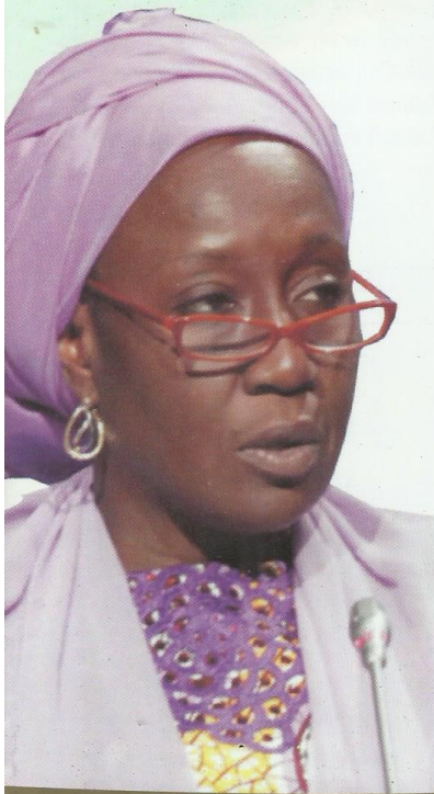
Hajiya Aisha Abubakar Hon. Minister of State (FMITI)