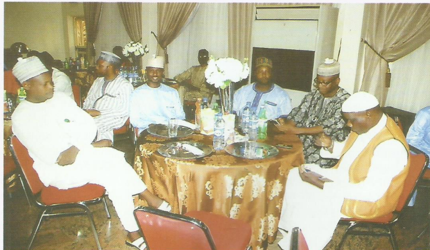
A cross section of NSDC staff at the award ceremony