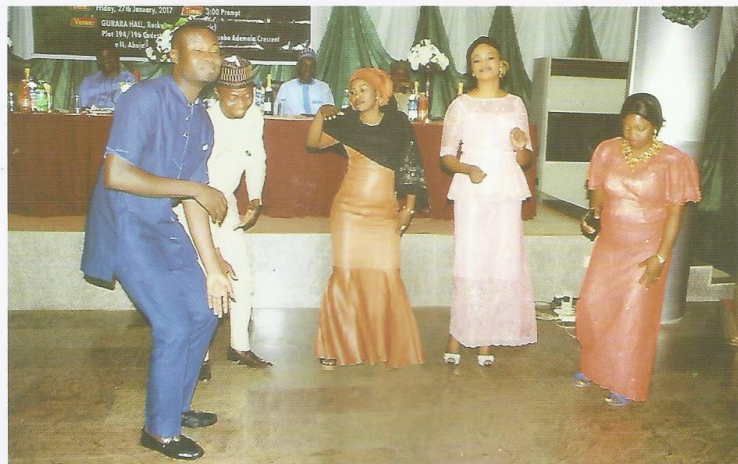
Truly, all work and no play makes NSDC Staff.. NSDC staff during a dancing competition at the event