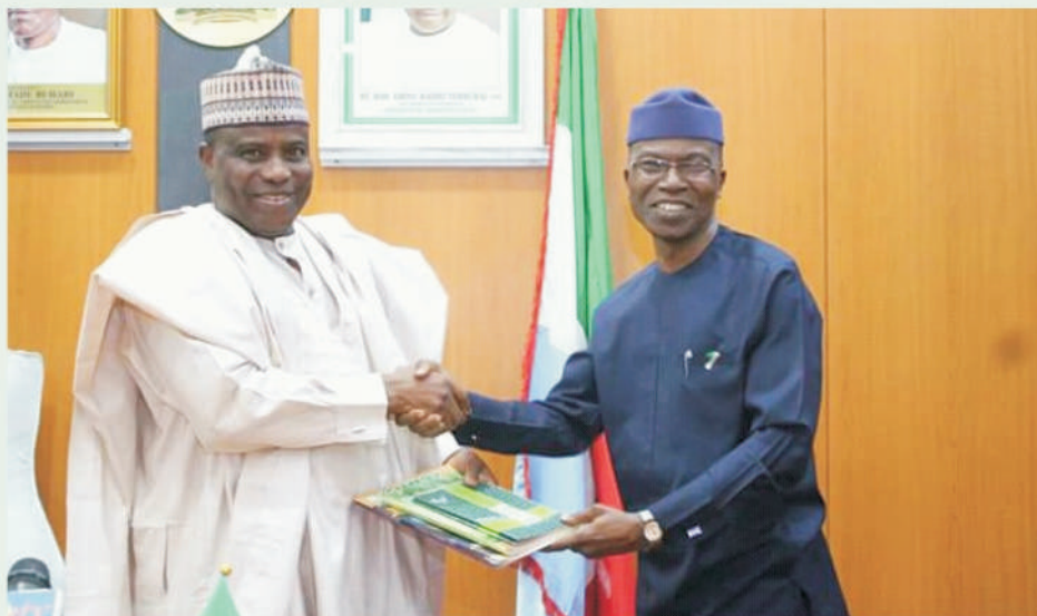
R-L: Executive Secretary, National Sugar Development Council (NSDC), Dr. Latif Busari presenting copies of NSDC Publications to Sokoto State Governor, Rt. Hon. Aminu Waziri Tambuwal during the MOU signing between Sokoto State and Gornyony Sugar Factory in Sokoto State.