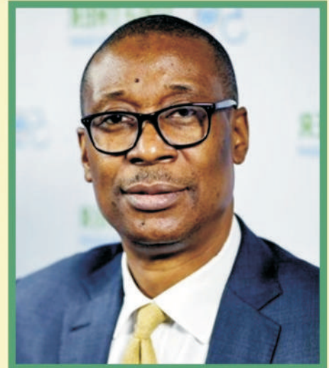
Dr. Okechukwu Enelamah Honourable Minister of Industry, Trade and Investment,

guidelines, approve operational targets, and ensure efficient management of resources to achieve the set targets of your parastatals and agencies".