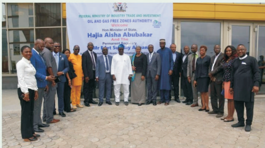
Participants at the one-day media workshop for Heads of Public Affairs Unit in FMITI in a group photograph session.