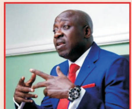
Mallam Bolaji Abdullahi Chairman, NSDC Governing Board

Mallam Abdullahi speaks English, Yoruba, Hausa and Pidgin English fluently and enjoys reading, photography, jogging and aerobics. He is happily married and blessed with children.