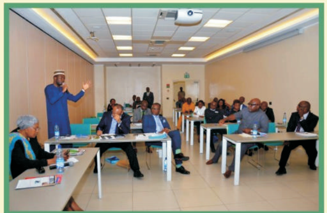
Participants at the one-day workshop for Public Affairs Officers held in Port Harcourt, Rivers State

Nigerian Export promotion Council, Nigerian Investment Promotion Council, Standards Organization of Nigeria, Nigerian Export Processing Zones Authority, Tafawa Balewa Square Management Board, Industrial Training Fund, Nigerian Commodity Exchange and the Oil and Gas Free Zones Authority were agencies present at the workshop.