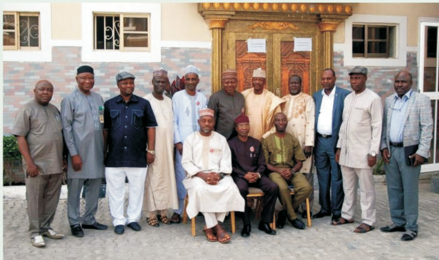
The NSDC Management team in a photo-session at the end of its retreat in Bauchi, Bauchi State.