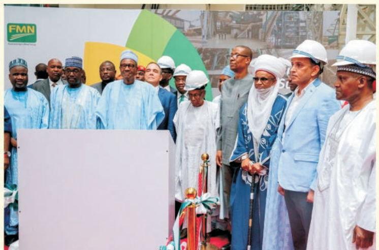
President Muhammadu Buhari, flanked by dignitaries during the official commissioning of the Sunti Golden Sugar Estates, Mokwa, Niger State.

The Sunti Golden Sugar Estate occupies 17,000 hectares of land in Mokwa local government area of Niger state out of which 10,000 hectares is being used as sugarcane farm.