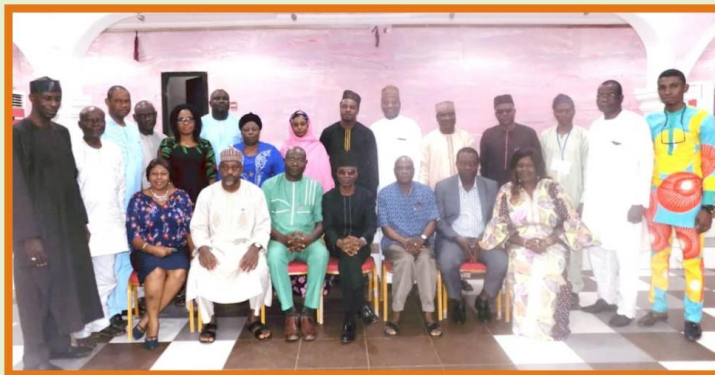
The E.S and other NSDC staff in a group photograph during the Principal Officers' retreat in Ilorin, Kwara state.