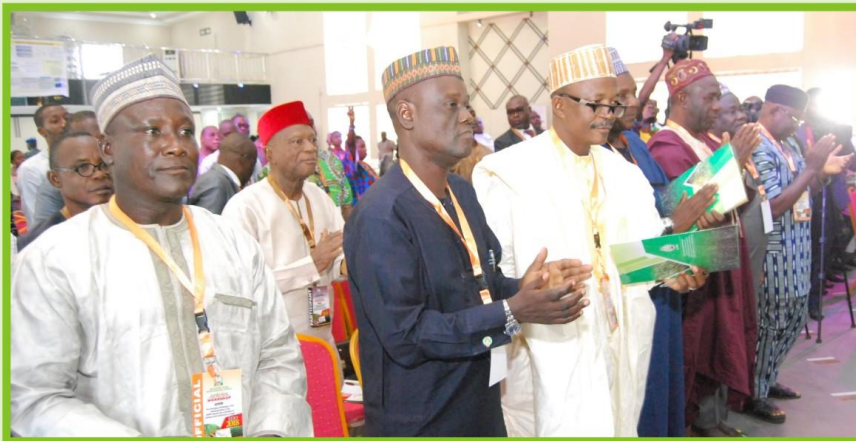
A cross section of participants and Council staff at the event