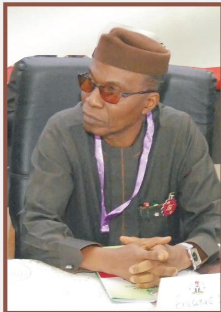
Dr. Latif Busari

He expressed optimism that with the faithful implementation of the sugar master plan, the government would achieve its objectives of job creation and attraction of investment into the sector.