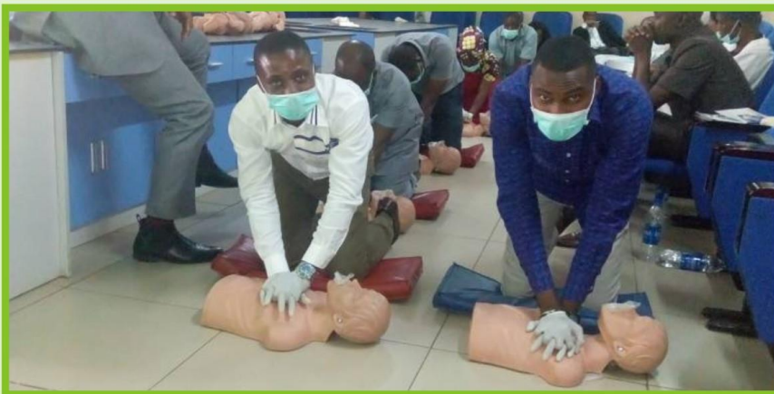
NSDC staff undergoing simulation exercise during an emergency response training programme organized by the Council for its personnel at the National Hospital, Abuja.