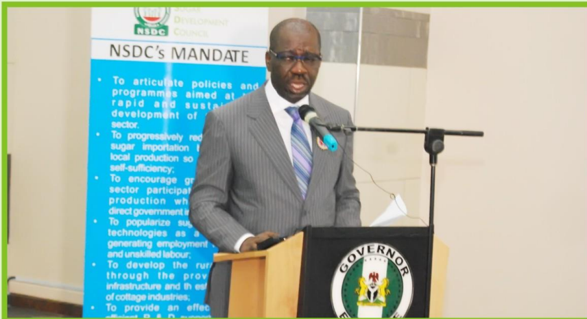
Edo State Governor, Mr. Godwin Obaseki delivering his keynote address at the Southern Region sensitization forum held in Benin City, Edo State.