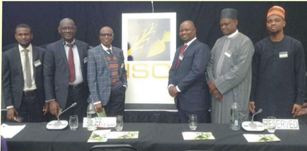
Sugar Council's delegation to the 27th International Sugar Organization (ISO) Conference in London