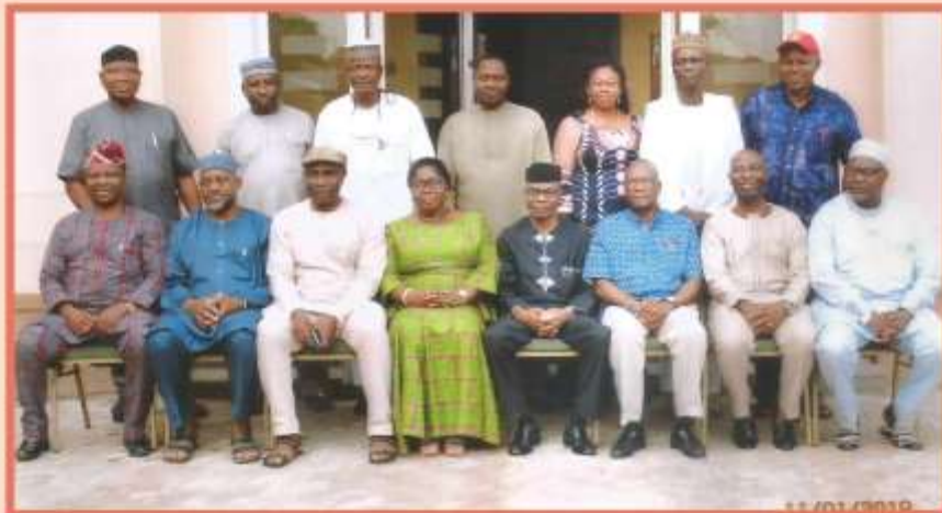
Members of the NSDC Management Team in a group photograph with their facilitators at the end of their retreat in Calabar, Cross-Rivers State.