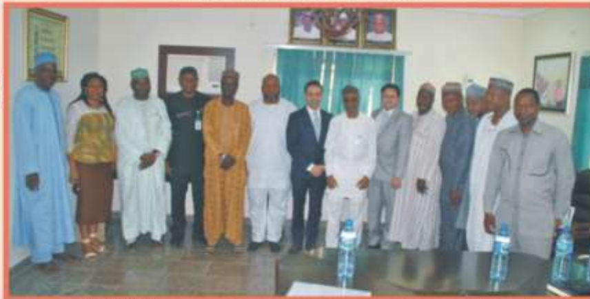
The NSDC Management team in a photo-session with representatives of Ashoka during their visit to the Council's office in Abuja.