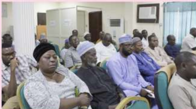
A cross-section of NSDC staff during Council's general staff meeting held at the Sugar House in Abuja