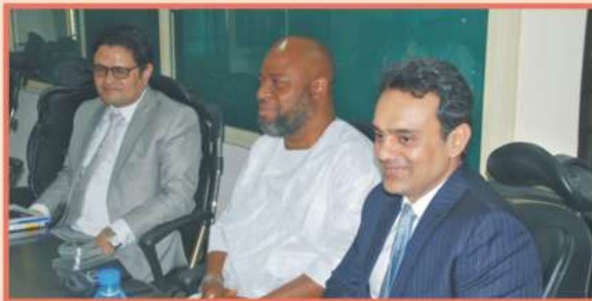
Members of the Ashoka delegation during their visit to the Council