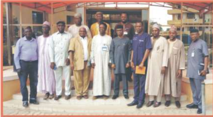
The NSDC delegation to University of Ilorin in a group photograph with members of the University management.