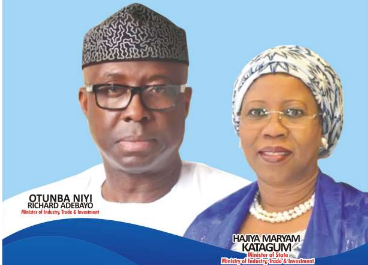
OTUNBA NIYI RICHARD ADEBAYO

Minister of Industry, Trade & Investment