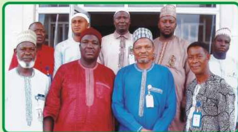
NSDC senior drivers at the end of a training programme on defensive driving and safety management at the Nigerian Institute of Transport Technology (NITT) Kano Study Centre