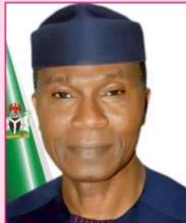
Dr. Latif Busari Executive Secretary National Sugar Development Council

organized 30 Congresses, usually at 3-year intervals. The last Congress was held in Tucumán, Argentina from 2 to 5 September 2019. The next XXXI Congress is scheduled December 2022 in Hyderabad, India.