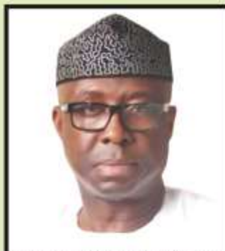
Otunba Niyi Richard Adebayo Minister of Industry, Trade & Investment

He said that the Buhari administration had done a lot in the area of agriculture and non-oil sectors; stressing that sugar sufficiency would further support such initiatives.