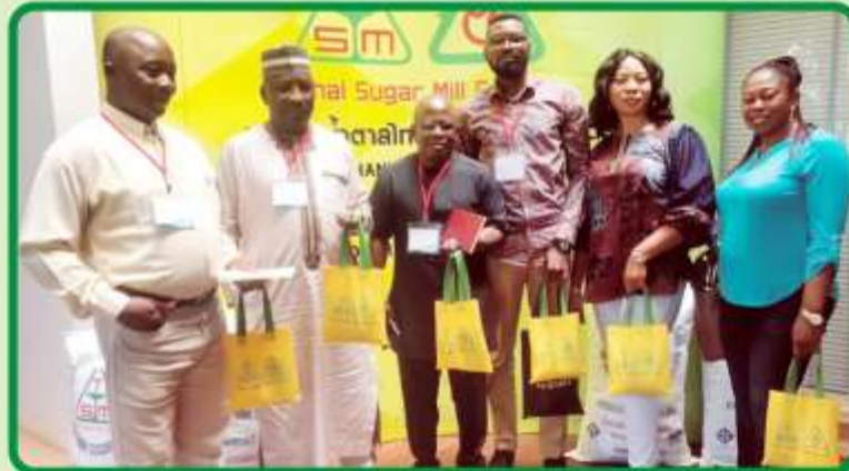
Nigeria's delegation to the 2019 edition of Thailand International Sugar Conference in Khonkean, Thailand.