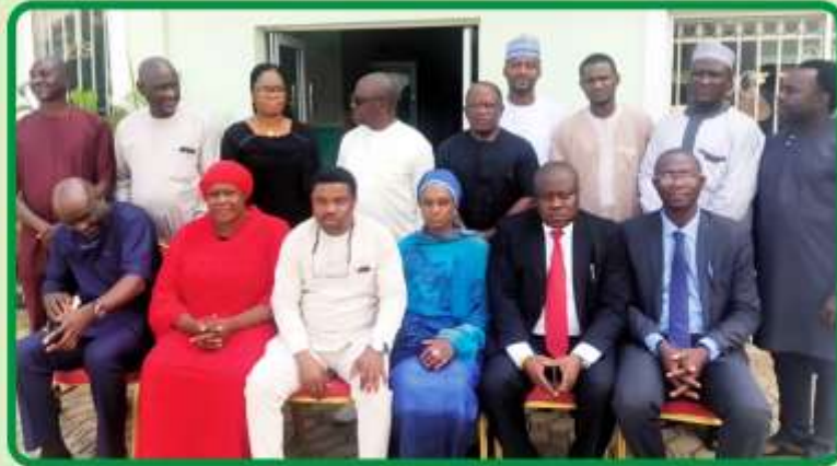
Some Council staff in a group photograph at the end of a two-day workshop on Effective Communication Skills for Organization Development held in Karu, Nasarawa State.