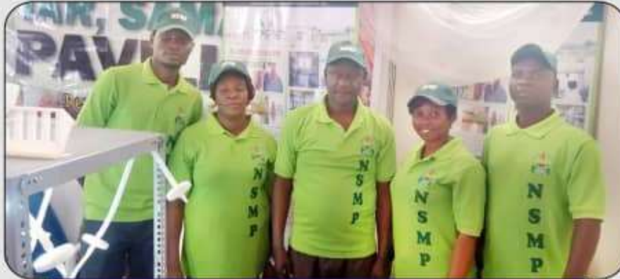
Staff of the NSDC Sugarcane Biofactory, Zaria in a group photograph during the Science and Technology Exhibition Organized by the Federal Ministry of Science and Technology in Abuja