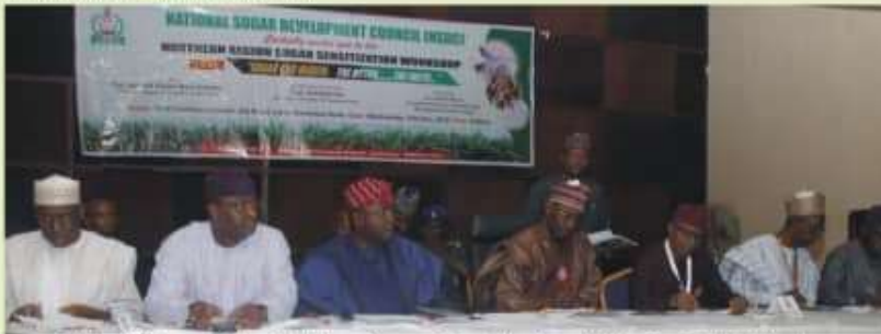
Stakeholders at the Northern Sugar Sensitization Workshop held in Lafia, Nasarawa state with the theme “Sugar and Health: Myths and Facts.”

The media in several countries have been awash in recent years with feature articles, opinions and so-called scientific information on the impact of the consumption of sugar on human health. Some even go as far as to label it “poison” or “toxin”. These have led to debates, discussions, claims and counter claims on sugar consumption and its implications on human health.