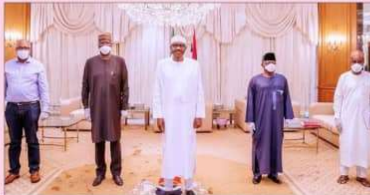
President Muhammadu Buhari and some members of the presidential task force on COVID-19

number of safety and precautionary measures to be strictly adhered by all. As it stands, virologists have confirmed that there is no known cure for the virus yet, but gave assurances that efforts are ongoing to find a cure.