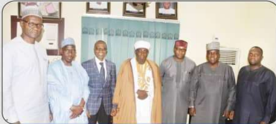
Members of the Nigeria Sugar Institute (NSI) Board of Directors in a group photo session shortly after the inauguration of the Board by the acting chairman of NSDC Board