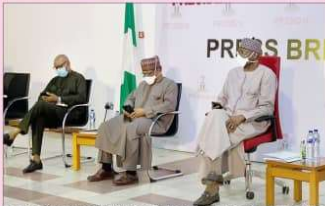
Some PTF Members during one of their daily media briefings in Abuja

Based on the advice of the Federal Ministry of Health and Nigeria Centre for Disease Control (NCDC), President Muhammadu Buhari directed the cessation of all movements in Lagos and the FCT for an initial period of 14 days with effect from 11pm, Monday, 30 th March, 2020. The restriction, according to President Buhari also