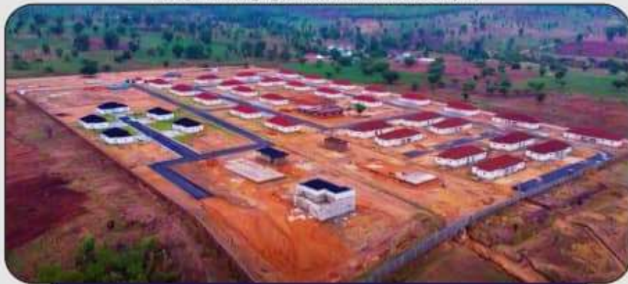
Aerial view of the Lafiagi Sugar Company (LASUCO) in Lafiagi, Kwara State. LASUCO is the Backward intergration programme (BIP) of BUA Sugar in line with the Nigeria Sugar Master Plan.