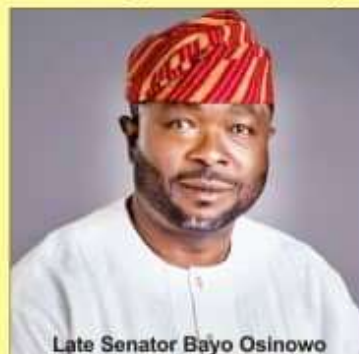
Late Senator Bayo Osinowo

Late Senator Adebayo Sikiru Osinowo was born on November 28, 1955. He was a member of the Lagos State House of Assembly. Until his death on 15 th June 2020, he represented Lagos East Senatorial zone at the 9th Nigerian National Assembly.