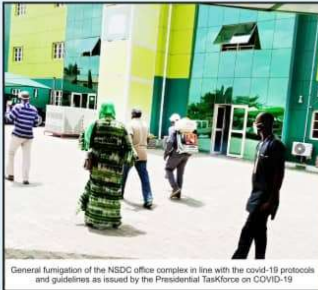
General fumigation of the NSDC office complex in line with the covid-19 protocols and guidelines as issued by the Presidential Taskforce on COVID-19

In compliance with a directive from the Office of the Head of Civil Service of the Federation for all government offices to be fumigated in the wake of the corona virus pandemic, the National Sugar Development Council (NSDC) has carried out a comprehensive fumigation of its headquarter building,