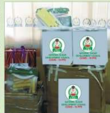
Samples of NSDC branded facemasks and shields ready for distribution to staff and partners of the Council