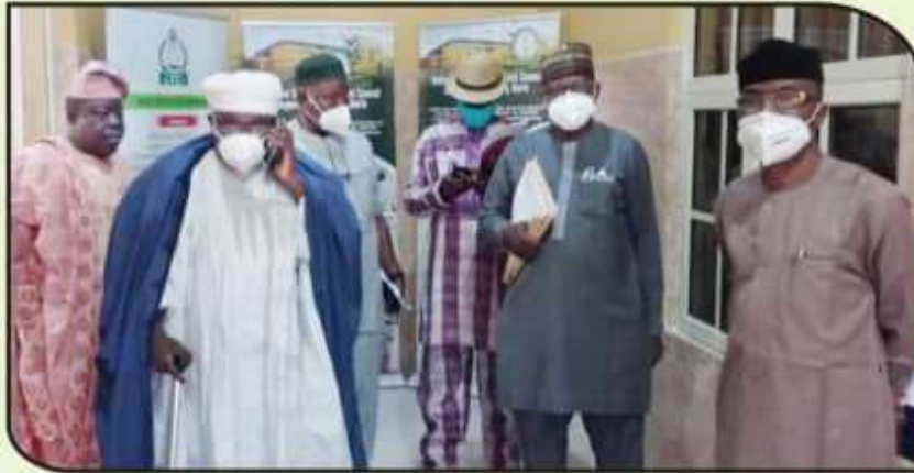
Members of the NSDC Governing Board and Management team during an inspection visit to the project site of the Nigeria Sugar Institute, Ilorin Kwara State.