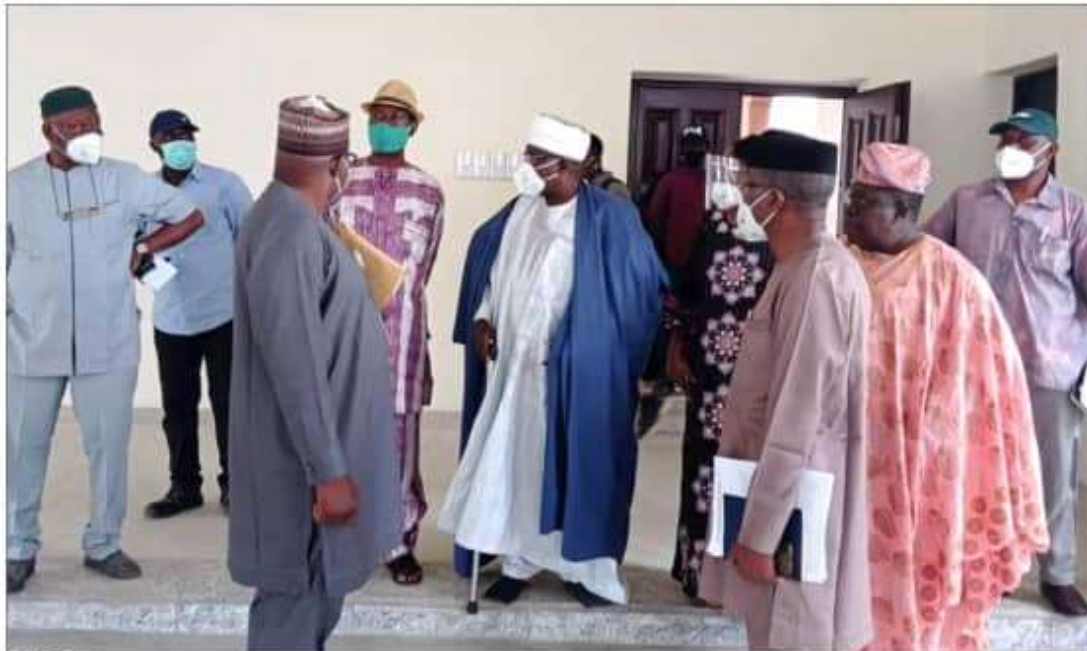
Governing Board and NSDC Management Team members during an inspection visit to Nigerian Sugar Institute site in Ilorin, Kwara State.