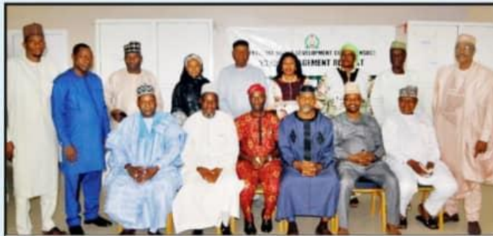
Members of the NSDC Management team in a group photograph with some retreat facilitators during their 2020 retreat in Sokoto, Sokoto State.

work-related issues such as mental health and wellness interventions in the new normal, workforce agility and mind set renewal as well as global perspectives of the future of