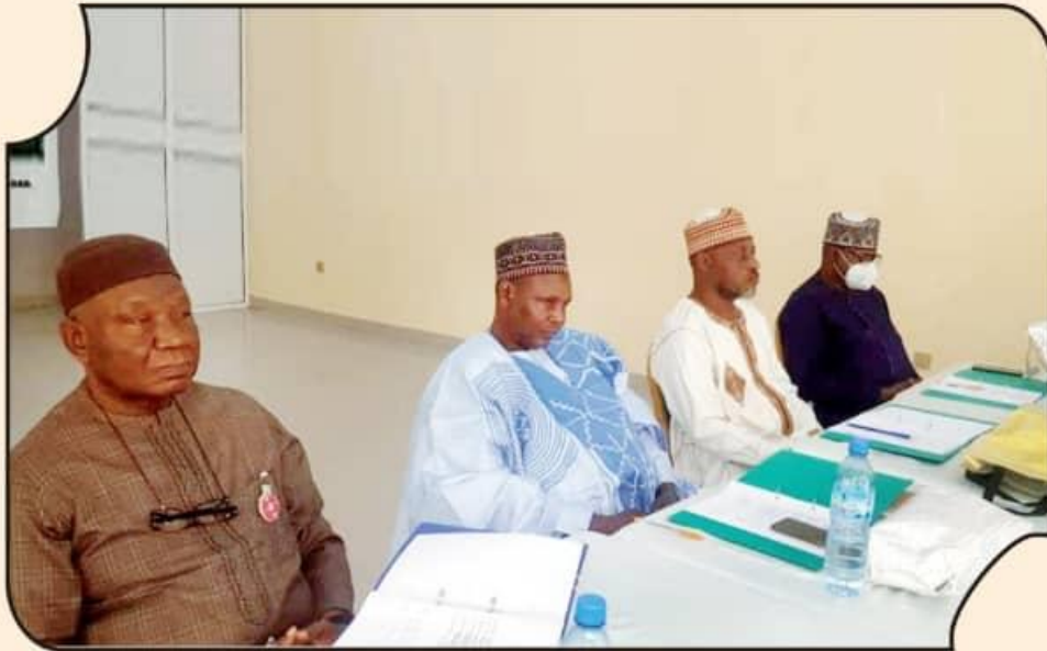
A cross section of Management Staff at the NSDC Management retreat in Sokoto, Sokoto State.