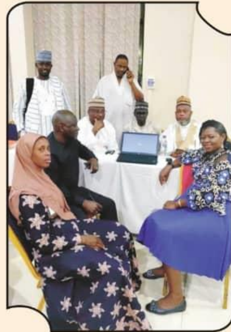
Members of the Principal Officers' retreat communique drafting committee putting heads together to achieve an implementable communique for subsequent adoption.